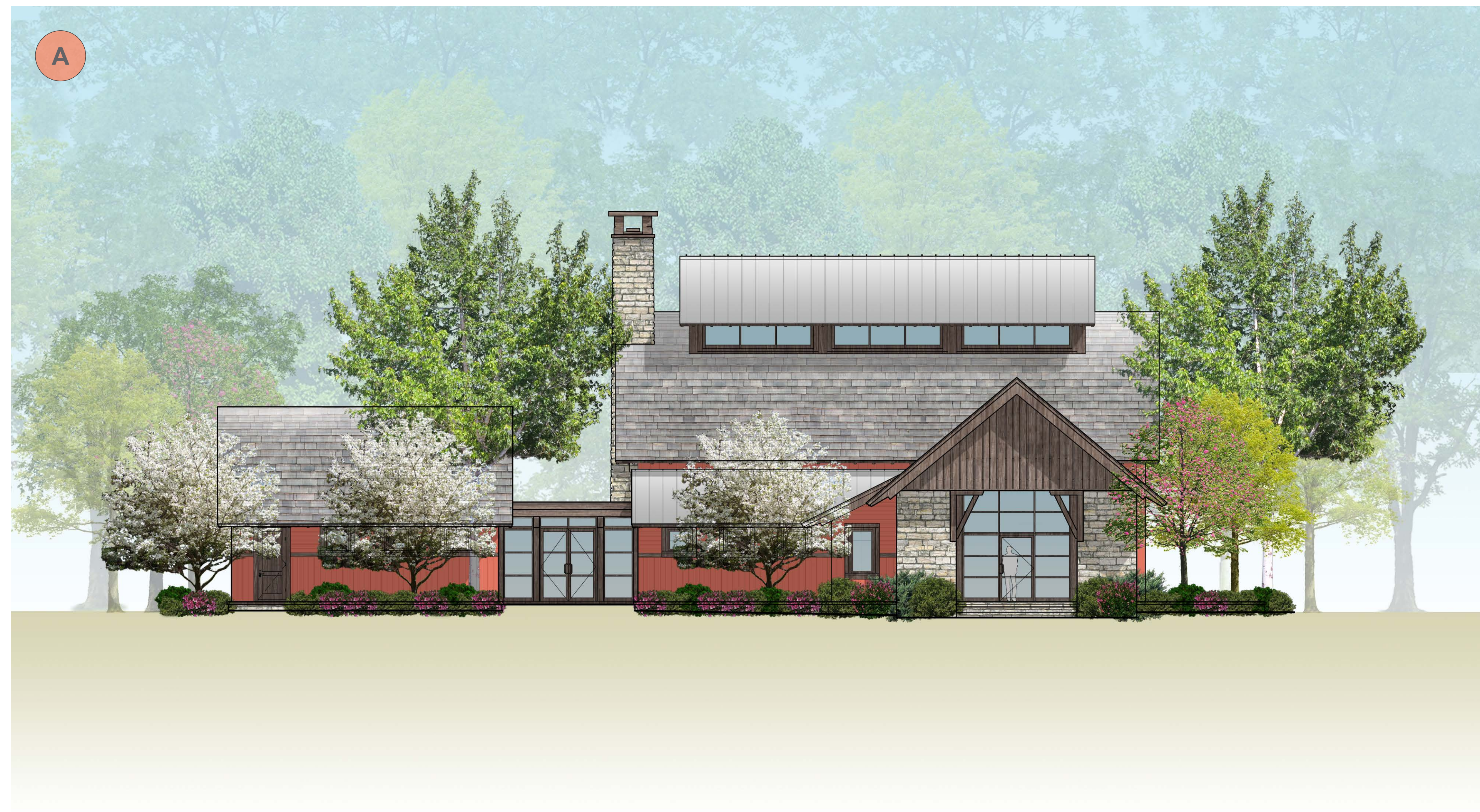
ACTIVITY BARN - ELEVATION FROM ENTRY