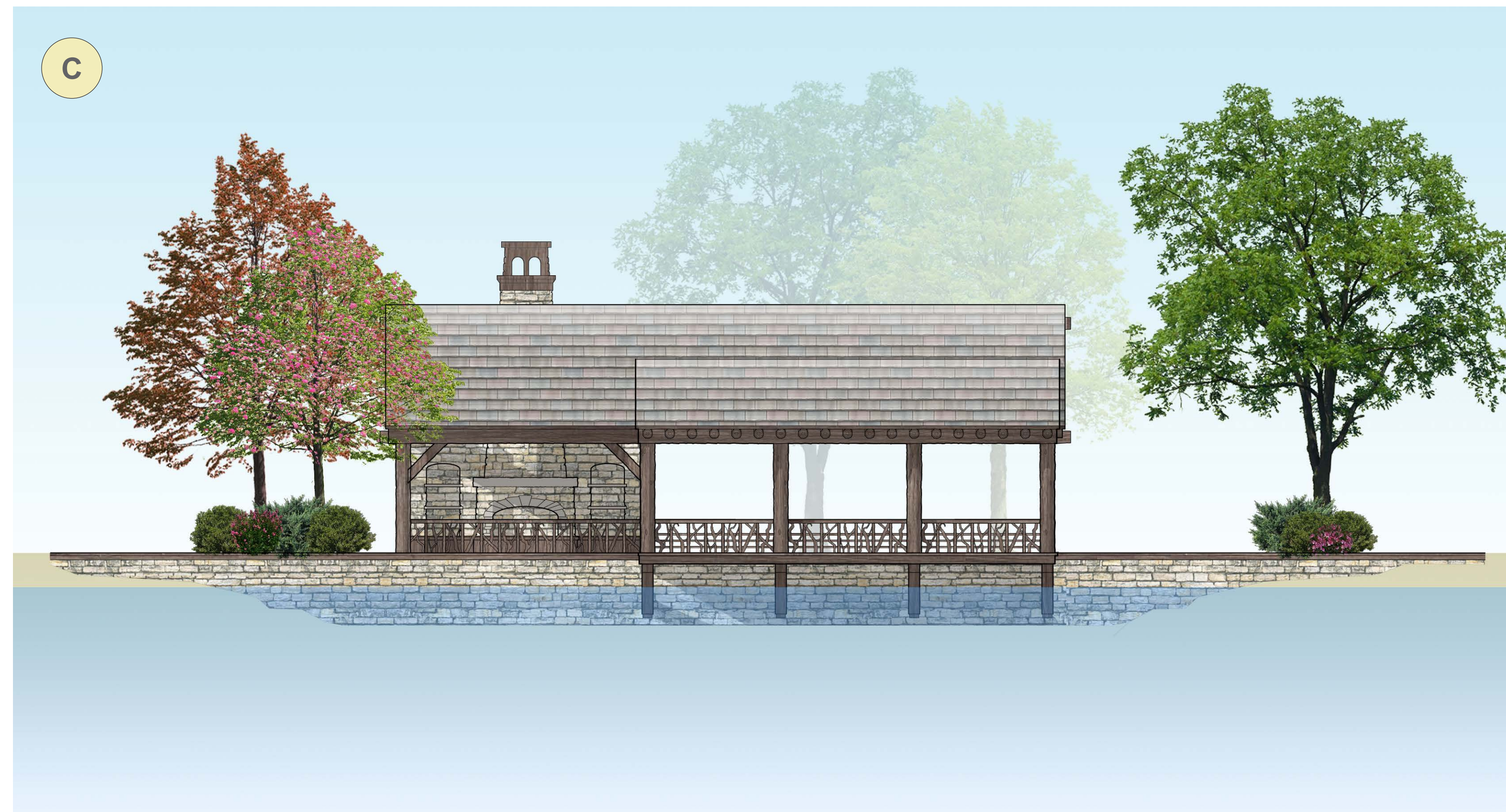
LAKE PAVILION - ELEVATION FROM LAKE