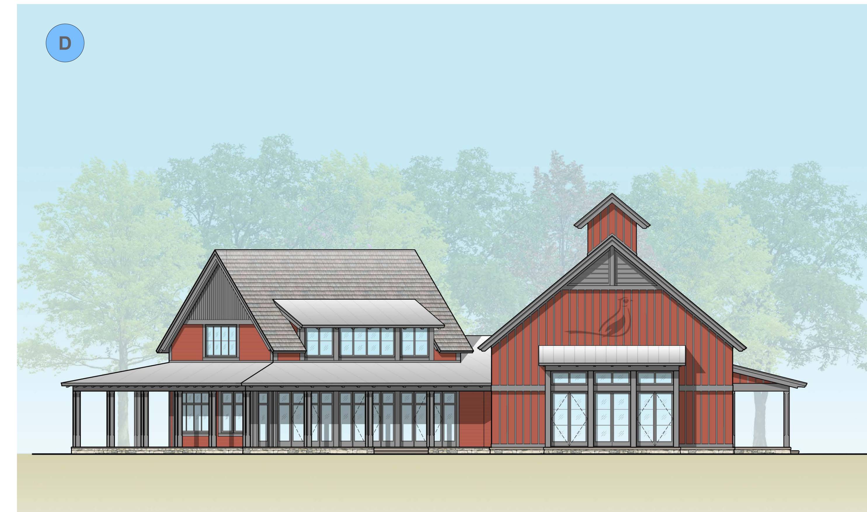
GOLF ACADEMY - ELEVATION FROM ENTRY